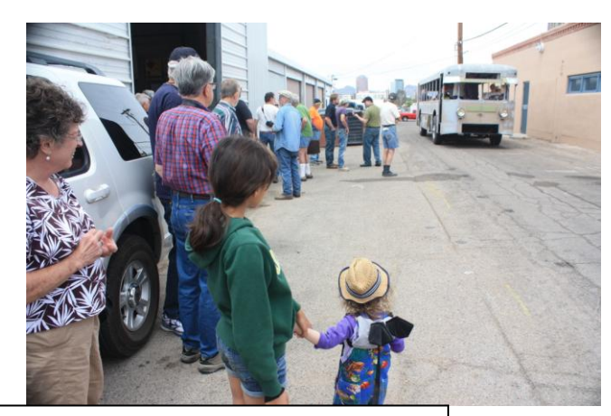
Guests watch as it comes down Hughes Street by our restoration shop.