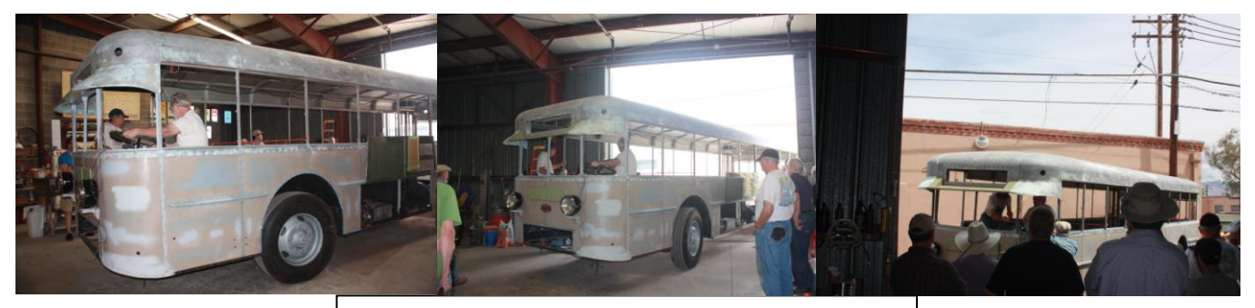
Backing it out of the shop for the test run.