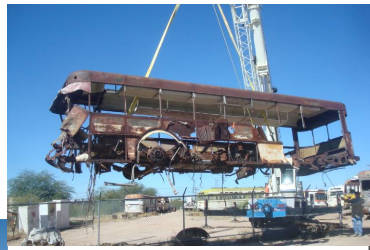
The 1929 Connecticut Twin Coach, our parts bus for the 1928 Bisbee bus, had to be moved by crane. Portions of the body collapsed during the moving process.

Most of the buses that couldn't be driven were towed using our bucket truck. Pictured here is Phoenix Transportation System #717, a 1947 Ford Transit Bus.