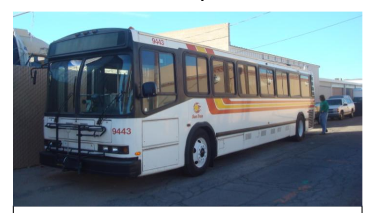
#9443 is a 1994 diesel powered Neoplan shown here next to our restoration shop. It is in good running condition.

In December we took delivery of two Sun Tran buses donated by the City of Tucson – photos below.