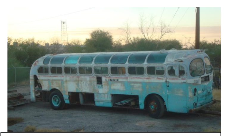
The way it looks today - much in need of repair.